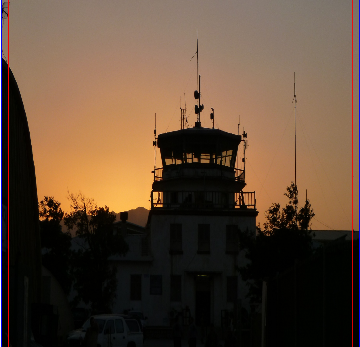
Above: The old Bagram ATC Tower silhouetted by a glowing sunset